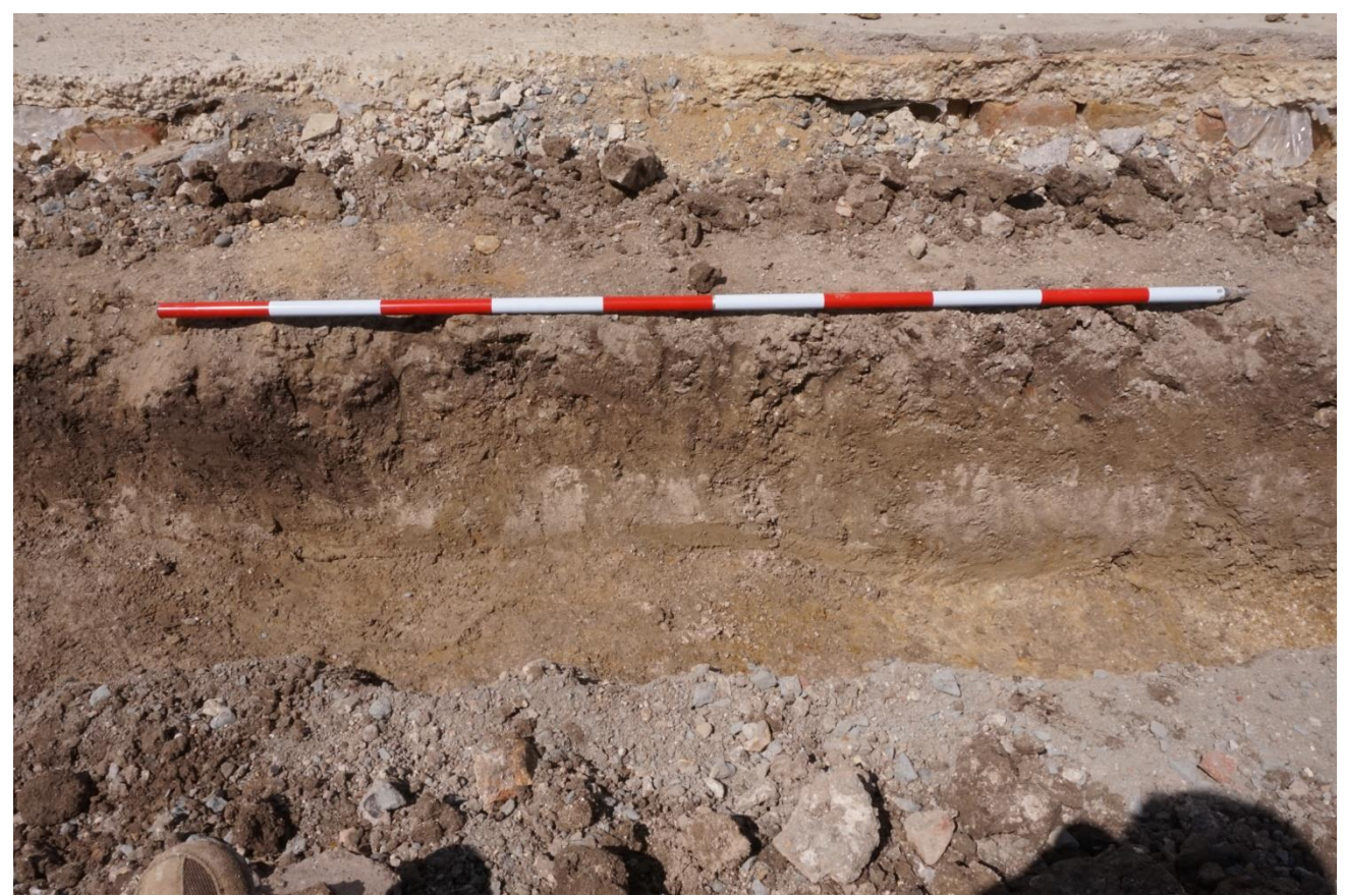
Plate 3: Looking west at representative section through made ground deposits exposed throughout the trench.