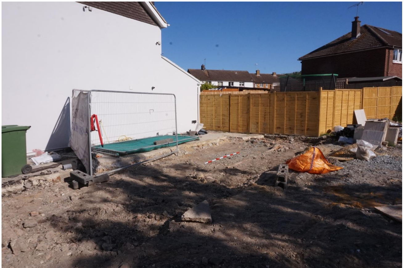
Plate 1: Looking north west at the site prior to trench excavation. Concrete floor and bedding was removed to the depth of 0.35m