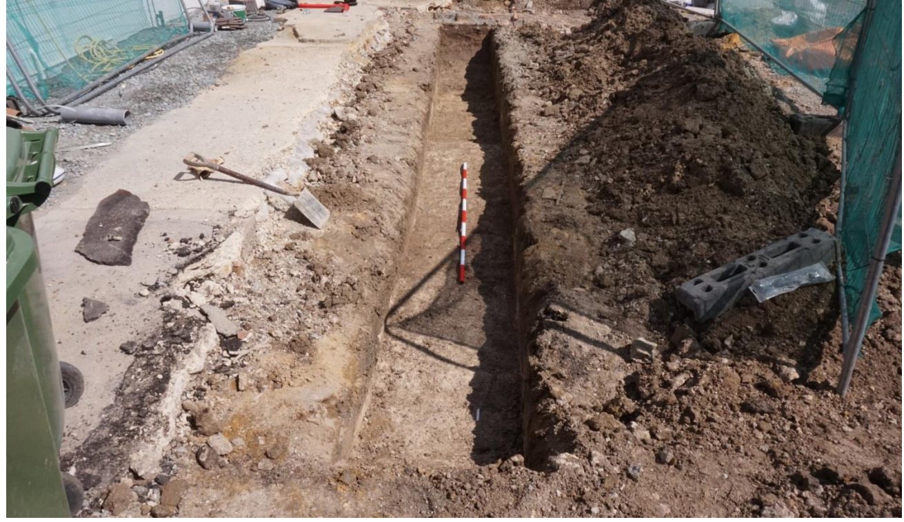
Plate 2: Looking north at the trench