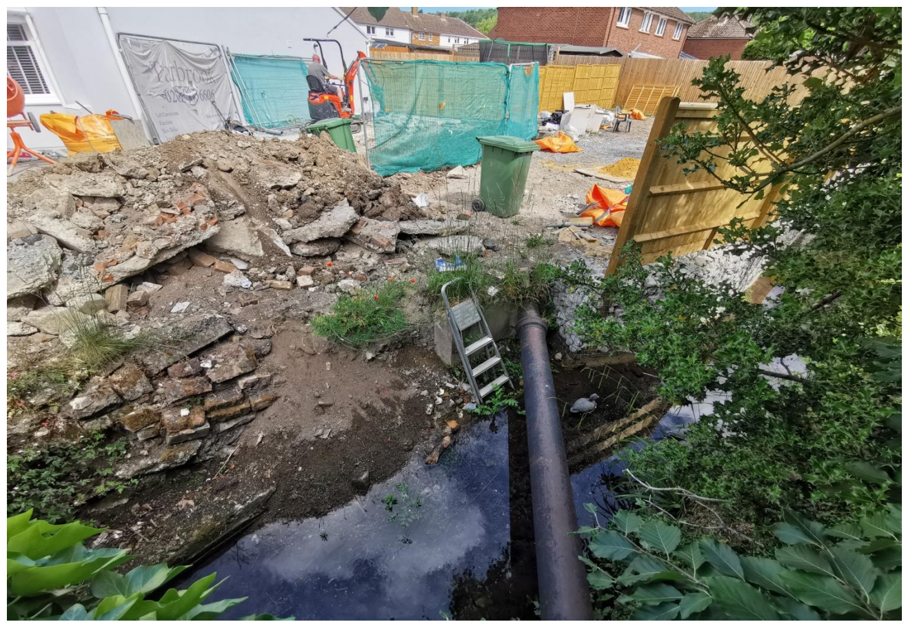
Plate 4: Looking north-west at stream located alongside east boundary of the site and pipe going into the site.